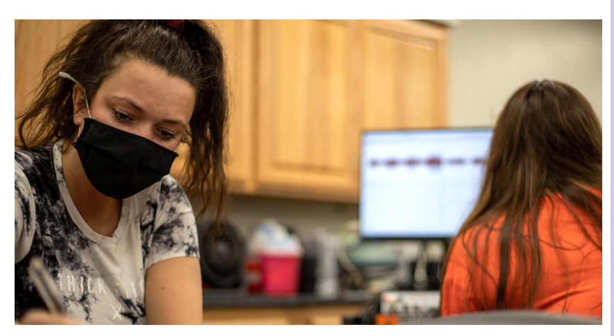
Seminole State College will host four mobile enrollment throughout the College's service area in the month of April.

Seminole State College will host mobile enrollment events in Shawnee, Prague, Okemah and Holdenville throughout the month of April. These events are for summer and fall enrollment. An academic advisor, an admissions representative and a recruitment specialist will be present to answer questions and guide perspective students through the enrollment process. There is no minimum GPA or ACT score required for admission.